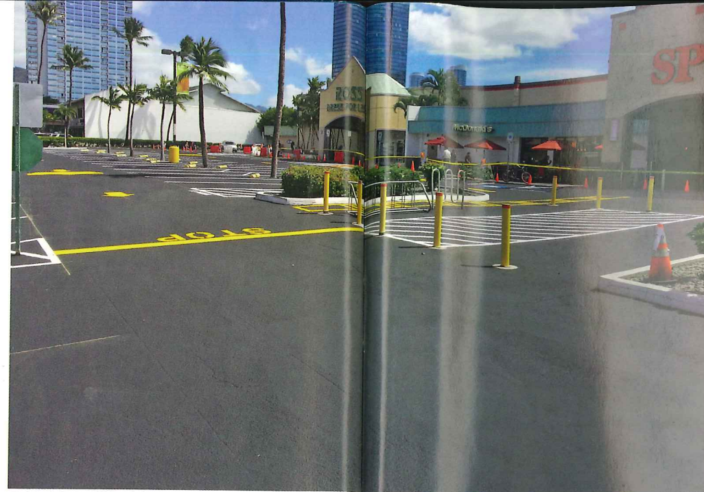
A fresh lot at Ward Centers

Sealcoating is the best way to add years to the life of your asphalt, if the property has no cracks or potholes. If the lot looks rough or unfinished, a quick seal coat will add 2 to 5 years to the surface.