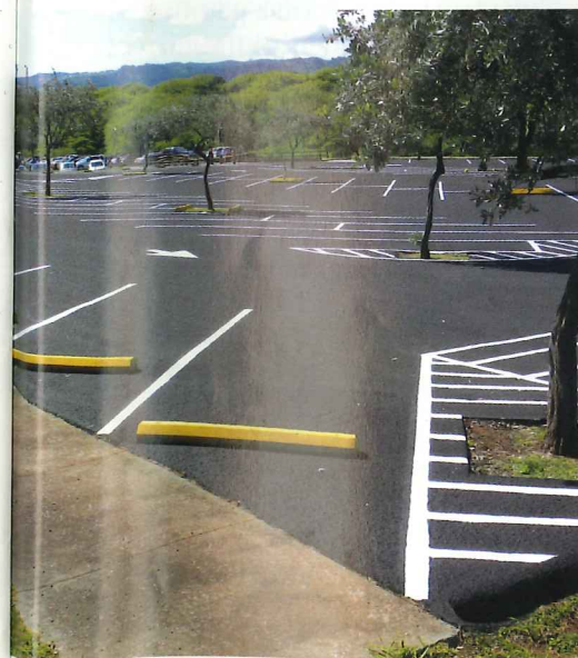
Hanauma Bay sealcoat