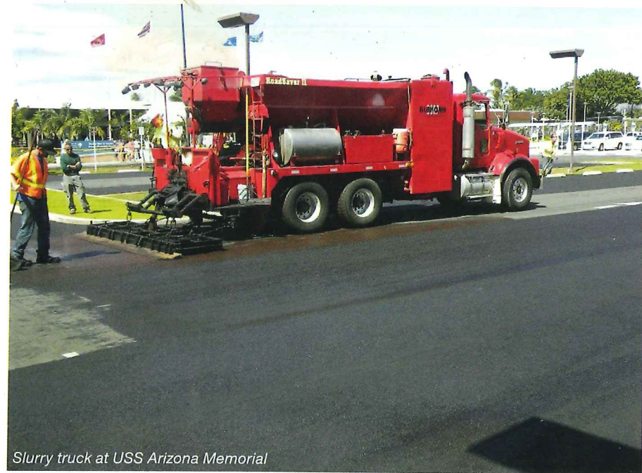
Slurry truck at USS Arizona Memorial

RAILCRAFT ALUMINUM RAILING SYSTEMS WWW.RAILCRAFT.COM